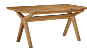
Parker Table, John Lewis