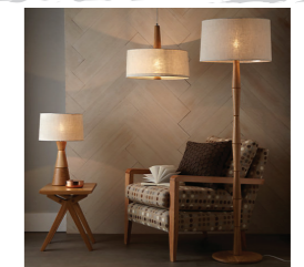
Noah Lighting, John Lewis